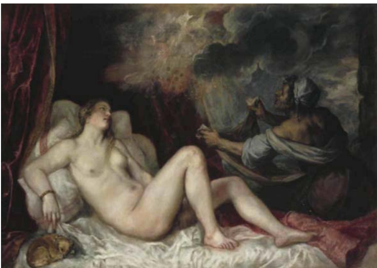
Tiziano Vecellio, called Titian (1488/90–1576), Danaë , Oil on canvas, 1.3 m x 1.8 m, Museo Nacional del Prado, Madrid, Inv. P00425

In contrast, “Women as Objects of Desire” pays tribute to the masterful sensuality of sixteenth-century Venetian painting. The only reclining female nude in Veronese's entire oeuvre is found in the Allegory of Love III: Respect (National Gallery, London). Titian's poetic nature is expressed in his approach to myths, in this section that of Danaë: he reinterprets the story by introducing the character of the elderly nursemaid, thus imposing an iconography adopted by later artists, for example Tintoretto (Musée des Beaux-Arts, Lyon). His Danaë (Museo Nacional del Prado, Madrid), painted only four years after the version from Naples presented in the introductory section, is the last painting that the visitor sees before leaving the exhibition.