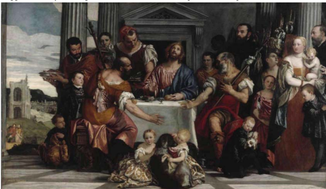
Paolo Caliari, called Veronese (1528–1588), The Supper at Emmaüs, Oil on canvas, 2.42 m x 4.16 m, Musée du Louvre, Paris, Inv. 146

The influence of Titian, whose Saint Jerome in the Wilderness (Musée du Louvre, Paris) was the first painting to depict a scene at night, is clearly felt in the works of his contemporaries, from Veronese, whose life came to an end as his palette became more somber, at times even gloomy ( The Dead Christ Supported by the Virgin and an Angel , State Hermitage Museum, Saint-Petersburg), although this painter's canvases suggest an early evening rather than nocturnal atmosphere, to Jacopo Bassano.