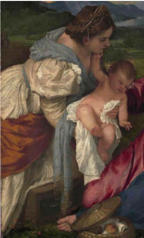
Tiziano Vecellio, called Titian (1488/90–1576), Madonna and Child with Saint Catherine , called The Virgin with the Rabbit (full view at bottom right, detailed views above and below), c. 1525–30, Oil on canvas, 0.71 m x 0.87 m, Musée du Louvre, Paris, Inv. 743