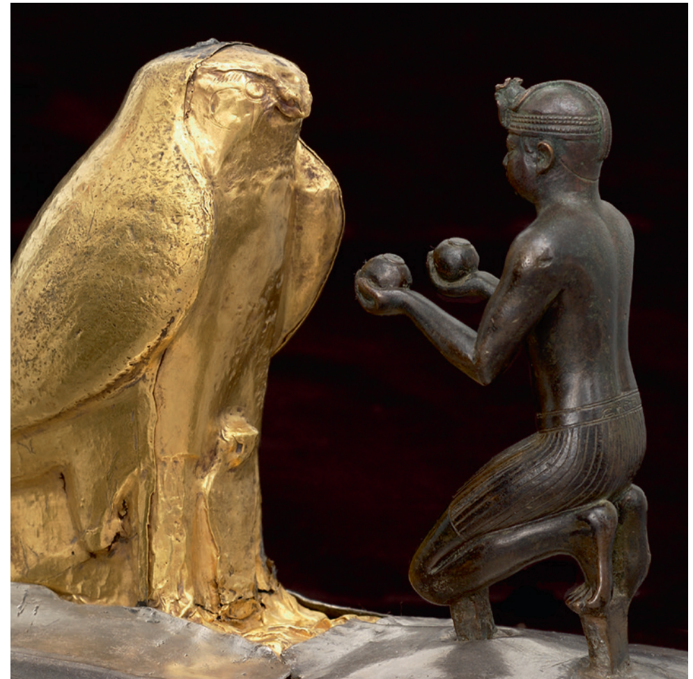
Front page: Tharqa and the Falcon God Hemen ©musée du Louvre, Christian Décamps.